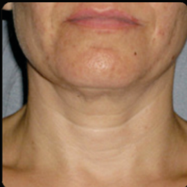
Post-Treatment: 180 Days