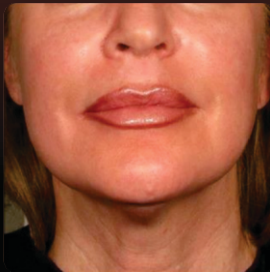
Post-Treatment: 90 Days